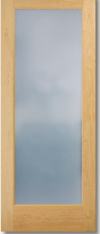
Uniform obscure glass with etched surface for a clean, timeless design.