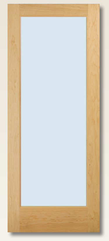
White laminated glass for light filtration and privacy.