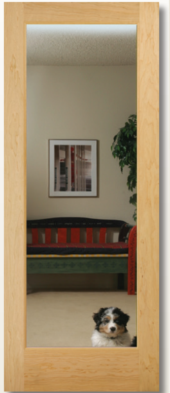
Full length two-sided mirror door for viewing open or closed.