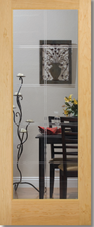
Grooved 10-Lite French door with beveled grids.