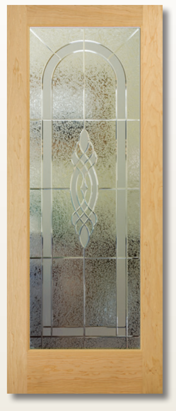
Single piece glue chip glass with high obscurity.