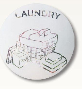
Available in 2/6, 2/8, 3/0 only