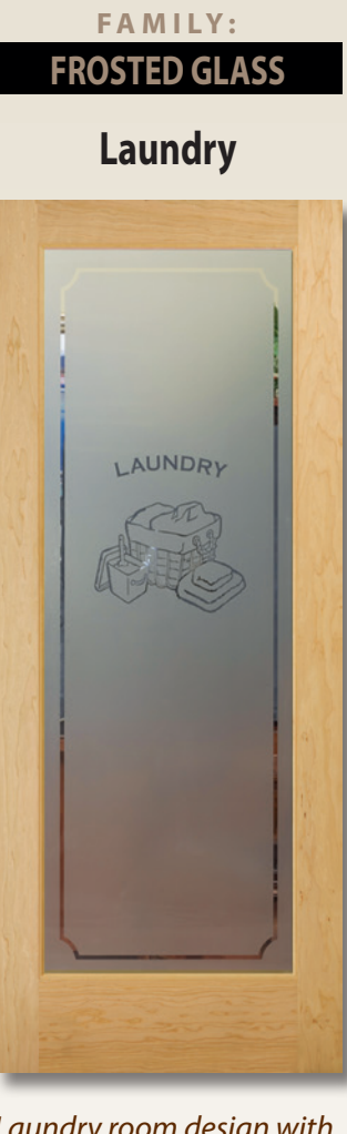
Laundry room design with frosted marginal border.