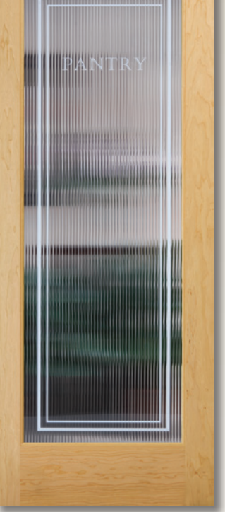
Fluted reed style glass for a sophisticated upscale appearance. Pantry wording etched on smooth side.