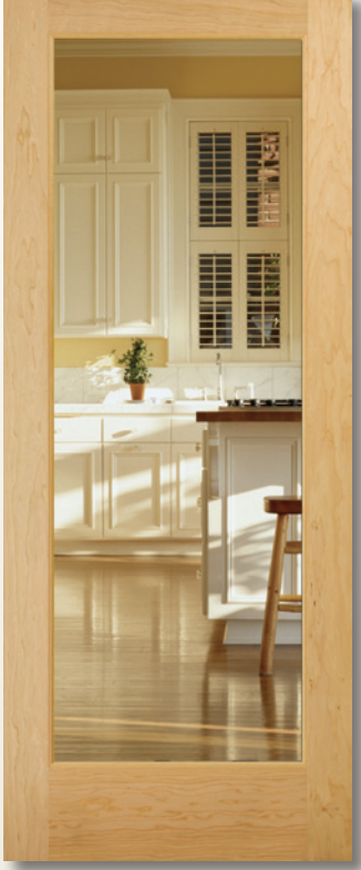
Classic one-lite clear glass French door.