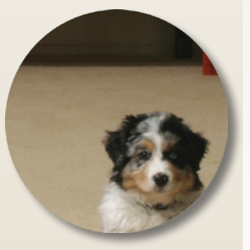
Available in Full Glass 8/0 High (No Bottom Panel)