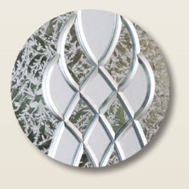
Frosted glass with triple border for a contemporary look.